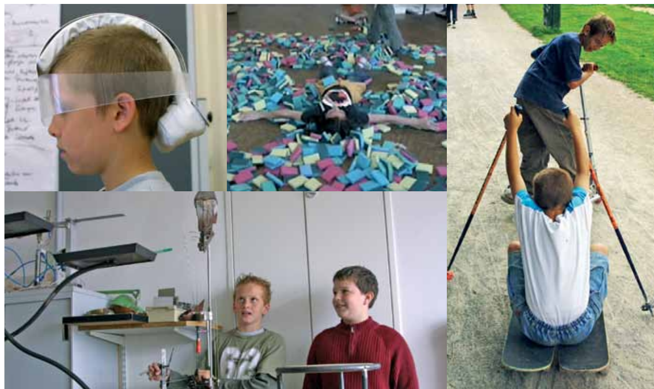
Example 4: design°mobil, an initiative of the Department of Design, Architecture and Environment for Art Education at the University of Applied Arts in Vienna supported by KulturKontakt Austria. During Designmobil processes the participants slip into the designer role. They test out various brainstorming and design strategies and learn to become acquainted with the design process as a creative strategy for action. Amongst the themes are an analysis of stale codes, ergonomics and useability, creating a market and human factors. Experiencing design processes serves to reflect on the status quo and sounding out possible design solutions. The goal of this activity is breaking with convention, re-thinking things and opening up new areas for action.