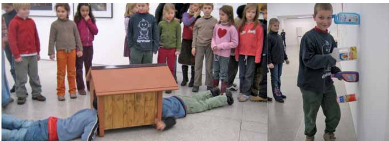
Example 3: Art education – educating through art. A primary school class examined the artworks in the exhibition “The artist who swallowed the world” by Erwin Wurm in the Museum of Modern Art in Vienna. In many different ways the exhibition offered the visitor an opportunity to explore the relationship of artist and viewer from different perspectives. Visitors themselves became active and contributed to producing the work.

6) Hartmut von Hentig, Kreativität. Hohe Erwartungen an einen schwachen Begriff (Munich, Vienna: Carl Hanser Verlag, 1998)