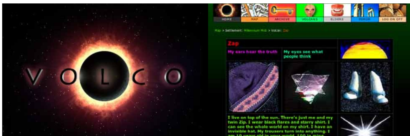
Example 14: Volco - a virtual planet in cyberspace by and for children. Volco is an evolving Virtual Online Co-Operative environment, a planet in cyberspace being constructed by children and young people communicating via the Internet and making links across geographic and cultural divides. The project taps into the energy of popular net culture and facilitates co-operative relationships between participants of different backgrounds and life experiences, while enabling a new, virtual society to emerge out of their combined imaginations. Inventing VOLCO children explore new, imaginative and co-operative ways of creating a better life on their own planet. www.volco.org

In this sense, too, the growing importance of cultural education is confirmed in many ways.