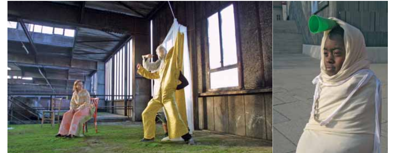
Example 1: School as a cultural centre. Staging curtain materials; developing possible roles inspired by fragments of costumes and space. Starting point: spontaneous theatre. Playful approach to variations in self-dramatisation. Examination and reflection on intentional and unintentional effects, experimentation with possibilities of social interaction. Interaction of different levels of the creative design process.

The function of schools in society is not only to give our children knowledge and skills, but to open up spheres of experience and development in which young people can get to know themselves and become familiar with the world, and which will comprehensively foster the development of their personalities.