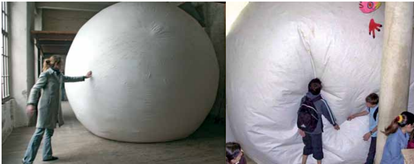
Example 2: textil:mobil was cooperative project that ran for a number of years between students of the Department of Textiles at the University of Applied Arts in Vienna, Austrian schools and a business. The goal was to promote a “material literacy” that was in the process of disappearing on the one hand and, on the other, to promote a learning culture that by using a sensual approach and joint artistic student work was intended to awaken curiosity, enjoyment and interest as well as leading to the formulation of relevant questions. These questions were explored and a number of works created that were spatially oriented and, above all, body oriented. They addressed issues related to the lives of young people, rendered their patterns of play and action visible, created references to their surroundings and tested new approaches.

A sensual approach lets children discover new worlds and come to grips with them in playful ways.