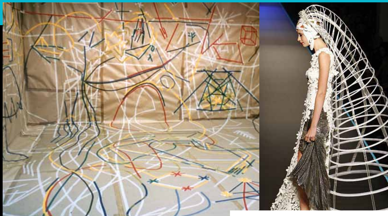
“Taperoom” (left); Graphic vizalisation and formulation of individual and group needs by a group of longterm clients in a psychiatric hospital in Luxemburg.

Creativity lives on freedom, not commands.